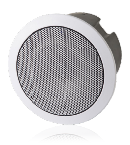
Public Address System

Text-to-Speech Interface integration seamlessly communicates with your exisiting PA system for enhanced widespread coverage